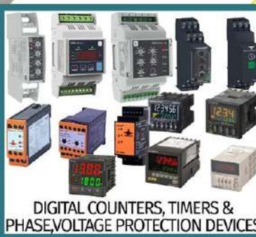
DIGITAL COUNTERS, TIMERS & PHASE VOLTAGE PROTECTION DEVICES