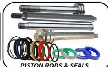
PISTON RODS & SEALS