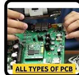
ALL TYPES OF PCB