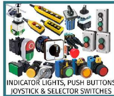
INDICATOR LIGHTS, PUSH BUTTONS JOYSTICK & SELECTOR SWITCHES