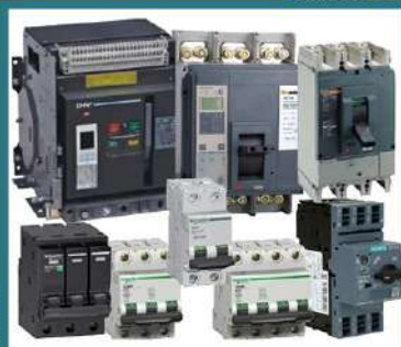
CIRCUIT BREAKER ACB, MCB, MCCB