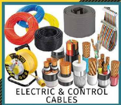
ELECTRIC & CONTROL CABLES