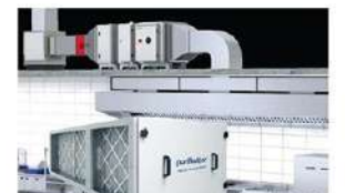
KITCHEN ECOLOGY UNIT