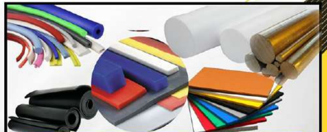
TEFLON,NYLON,PU,SILICON SHEETS & RODS