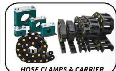
HOSE CLAMPS & CARRIER