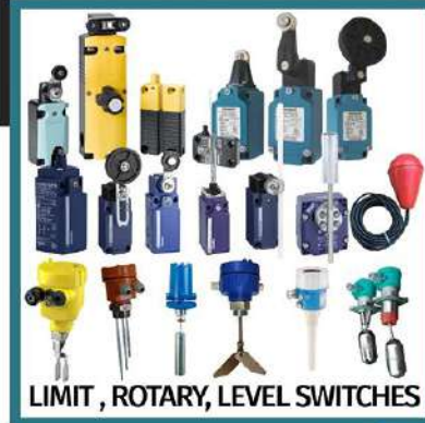
LIMIT, ROTARY, LEVEL SWITCHES