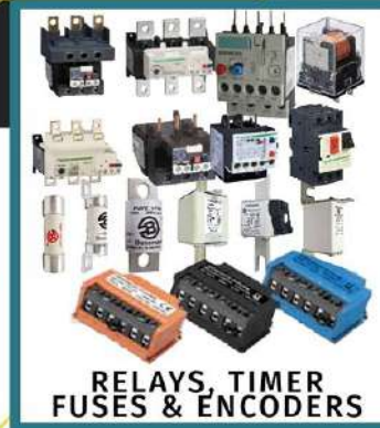
RELAYS, TIMER FUSES & ENCODERS