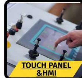
TOUCH PANEL & HMI