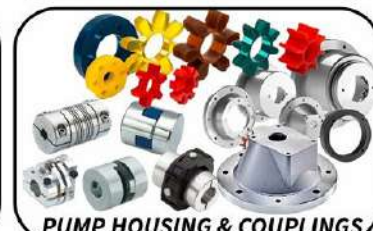
PUMP HOUSING & COUPLINGS