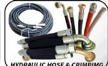
HYDRAULIC HOSE & CRIMPING