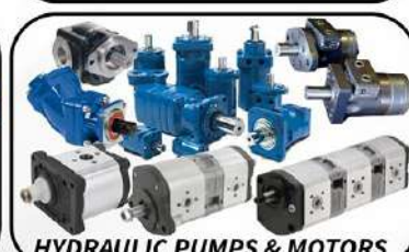
HYDRAULIC PUMPS & MOTORS