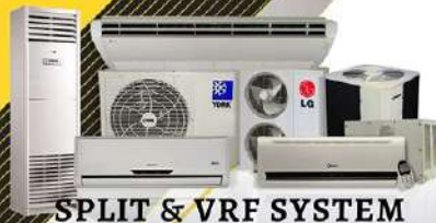
SPLIT & VRF SYSTEM