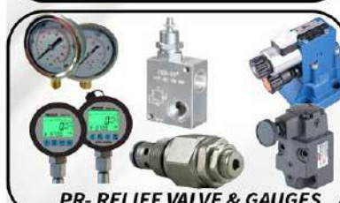
PR- RELIEF VALVE & GAUGES