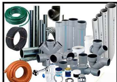
PLUMBING ITEMS & HOSES