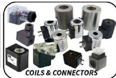
COILS & CONNECTORS