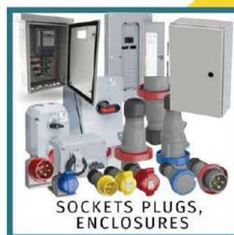
SOCKETS PLUGS, ENCLOSURES