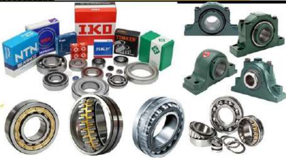
ALL TYPES OF BEARINGS